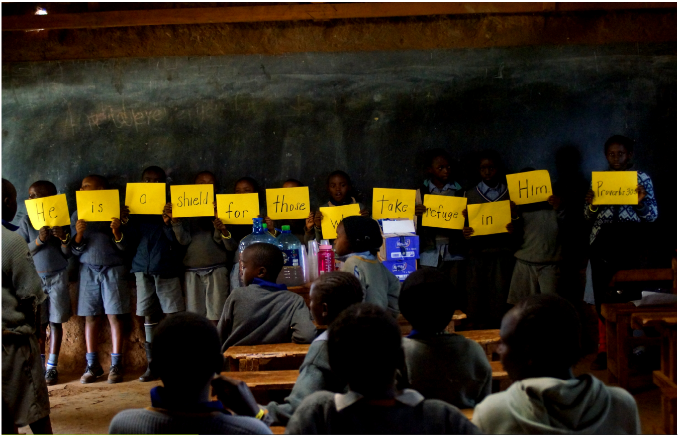
Summer 2015 Vacation Bible School at Nduchi Primary School