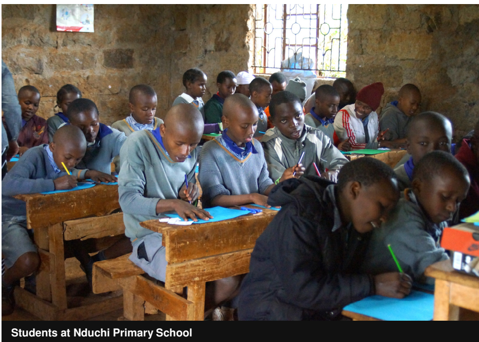
Students at Nduchi Primary School